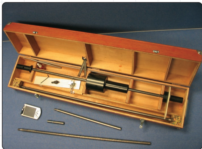
Complete kit showing optional extension shaft set and PDA